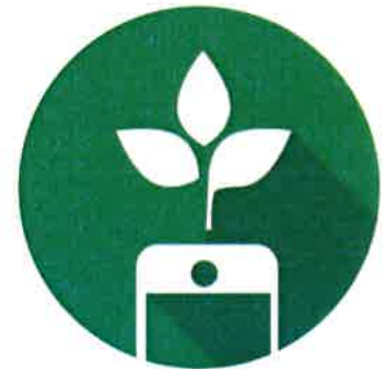
Download the Tithe.ly app from the Apple or Google Play Stores or give online at ndpeacelutheran.com

Tithe.ly makes it easy to give either with their app or by clicking the green "Give" button on our church website (ndpeacelutheran.com). You can give using your credit/debit card or you can give directly from your bank account. You can chose to give a onetime gift or set your gift up to be recurring. You can even designate which fund your gift will go to and leave a memo to indicate an honorarium or memorial.