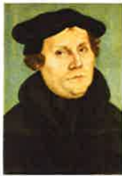
Quotes from Martin Luther

“To be a Christian without prayer is no more possible than to be alive without breathing.”