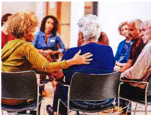
Next Meeting Nov. 9th

There will also be opportunities for people to volunteer on November 17 th . Volunteers will be needed to assemble baskets and to help carry baskets to people's cars.